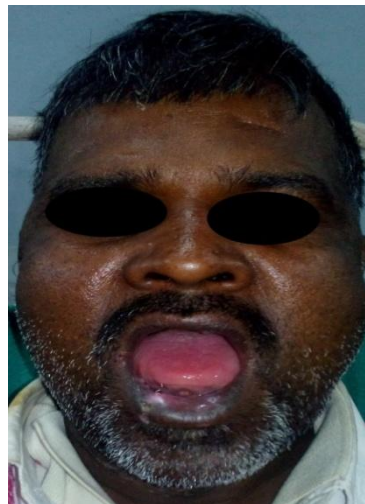
Fig.1: Clinical presentation of TMJ dislocation.

Further under general anaesthesia symphysis was osteotomized making two hemi-mandibles. Now manually each hemi-mandible was reduced followed by internal fixation of osteotomized symphysis.